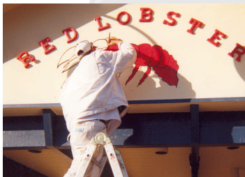
ISP Artist applies a personal touch

When first considering commercial painting, typically, one would jump to a conclusion that commercial painting is a utilitarian service—a labor-intensive task with a simple means to an end. Typically, a commercial painting crew is unfairly labeled as laborers instead of craftsmen. The finished product, after all, is the interior of a hospital, exterior of a strip mall or the restaurant where you take your family to dinner. We neglect to remember that we spend a considerable amount of time in these places shopping, dining, working and waiting. So before we discount commercial painting as a job of labor, ask yourself these questions; Can a commercial painting crew consider a strip mall, a canvas? Is the commercial painter an artist?